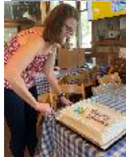
Photos from last year's BBQ