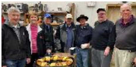
photo shows the volunteers at the San Antonio Mobility Worldwide workshop, eagerly waiting to enjoy the cake! Thank you, DIF Acuña!

volunteers from the San Antonio workshop, promising to deliver them to the shop the following day. This bottom