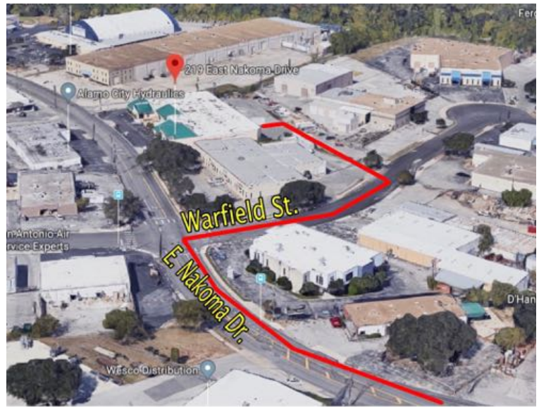
MOBILITY WORLDWIDE TX-SAN ANTONIO, 219 E. Nakoma Drive

But please do not just show up! Since this is a trial, we ask that you contact Tom Martin at (210)496-4784 no later than the prior Saturday to make sure enough people have signed up to warrant opening the shop. We are located close to the SA Airport. Please see the map to the right.